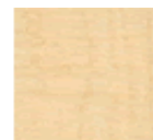
Wilsonart Fusion Maple 7909-60

*Note: Commonly known color shown in parenthesis