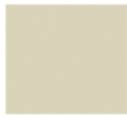
Pionite Putty Grey SG209 (LN)