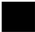
Pionite Black SE101 (DT)