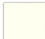
Formica Antique White 932-58