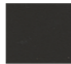
Formica Graphite 837-58 (MT)