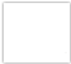
Formica White 949-58