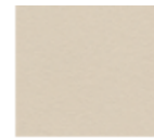
Formica Birch 921 (JT)